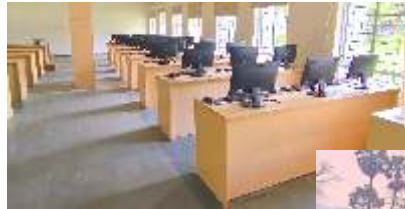
Computer Lab Bihar, Jharkhand, UP, MP, Meghalay, Sikkim & Rajasthan & many more...